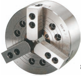
BB-208A5 BB-210A6 Refer to Fig.A